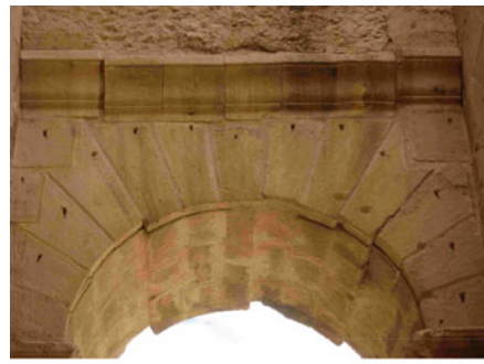
Fig. 2 Archaeoseismological evidence for damaging earthquakes in the middle part of Tunisia. a Dropped arch sectors. El-Djem amphitheatre. #6085. b Extruded blocks. El-Djem amphitheatre. #6062. c Penetrating fracture in arch masonry—parallel to stress. El-Djem amphitheatre. #6098. d Broken corners of columns: axial and oblique. Sousse, Ribat. #5794. Serial numbers refer to images in the archaeoseismological database (Moro and Kázmér 2019). e Shift between column and capital. Sousse, Ribat. #5800. f Twisted walls. Sousse. #5897. g Extruded masonry block. Sousse. #5805. h Displaced arch sector (fallen keystone). Sousse. #5867