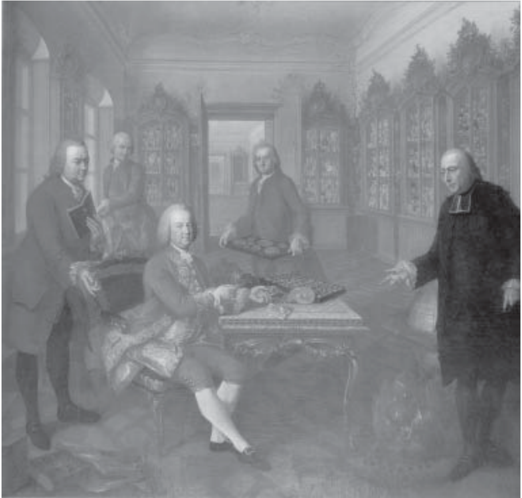
Figure 2. The Imperial Collection

extensive geological description of Vesuvius and a catalogue of all volcanic products together with their mineralogical and chemical analyses. It is one of several contemporary treatises on the active volcanoes and their products in Italy. 38