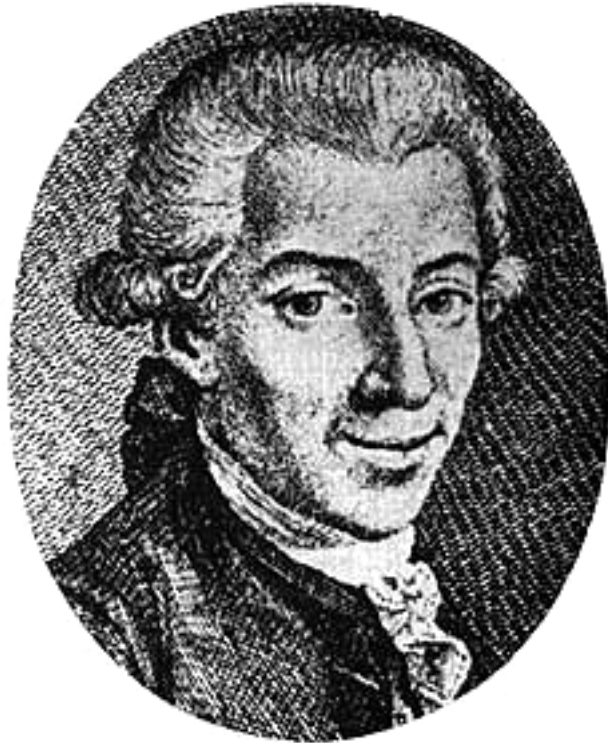
Figure 1. Ignaz von Born (1742-1791).

forbidden in the wake of the French revolution from 1794 by the new emperor Franz II. Born lived to see the demise of his journal and the dissolving of his academy, the lodge. However, his other great achievement, the Natural History Cabinet-turned-scientific-museum, survived him as an early symbol of imperial power and wealth 21 in the time when free thinking was severely limited in countries opposing the stormy events in France.